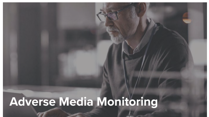
Adverse Media Monitoring